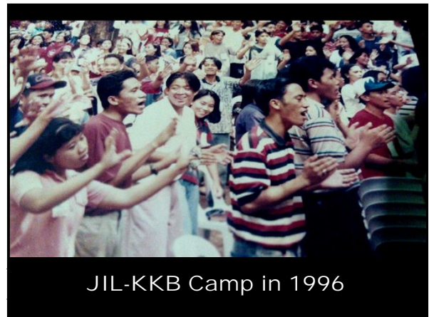
JIL-KKB Camp in 1996