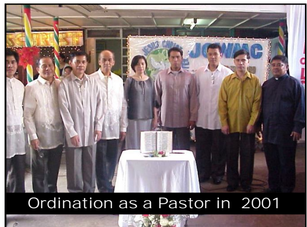
Ordination as a Pastor in 2001