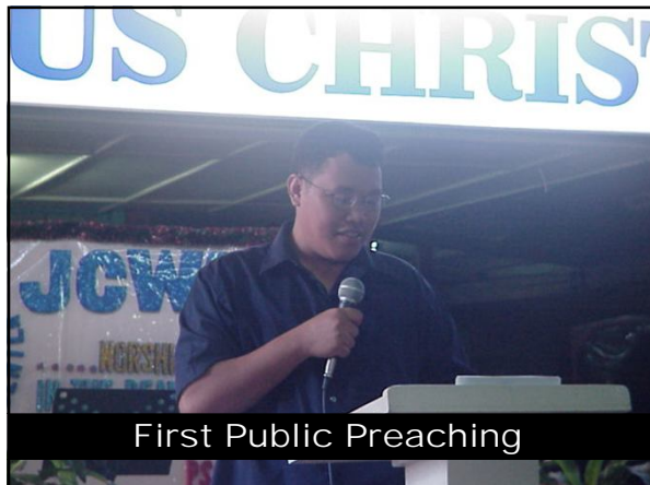
First Public Preaching