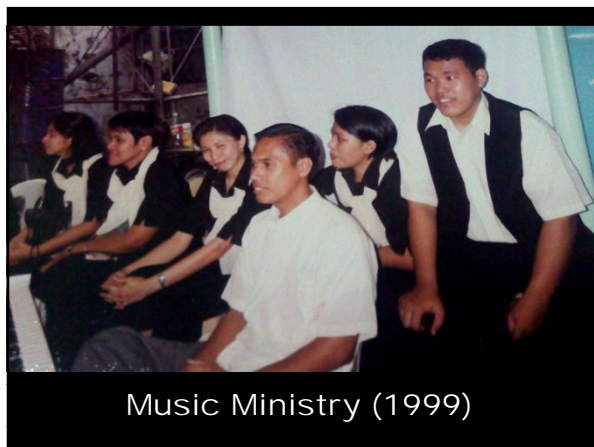
Music Ministry (1999)